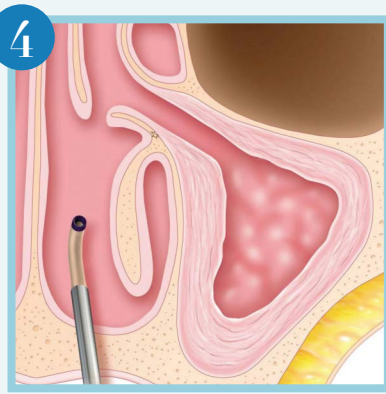
Illustration steps of a Balloon Sinuplasty<sup>™</sup> in the Maxillary sinus (cheek sinus): Using a thin sinus guide, the doctor threads a soft guide wire into the blocked sinus. A special sinus balloon rides over the guide wire into the sinus. The balloon is gently inflated just enough to open the sinus passageway. The balloon is withdrawn and the sinus is irrigated. Finally, the guide is withdrawn as the repaired sinus remains open so that normal drainage reduces the incidence and severity of future infections.

Other advantages of Balloon Sinuplasty™ over traditional sinus surgery include: